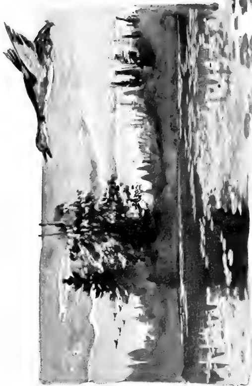
“WHILE GLOW THE HEAVENS WITH THE LAST STEPS OF DAY.” — Page 26.